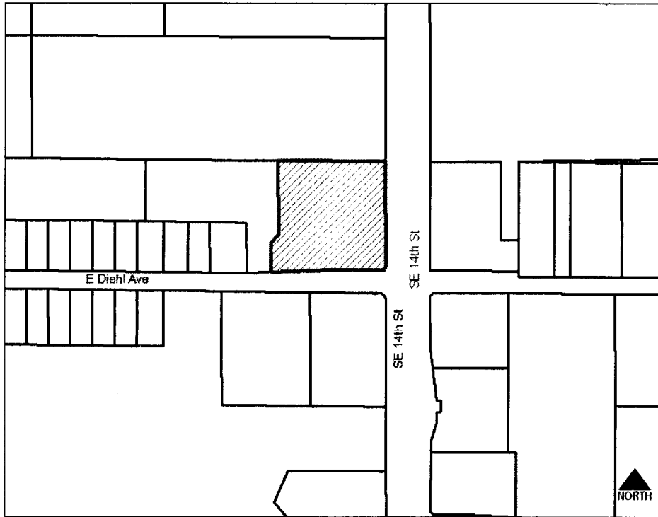
K G Store 573 LLC (PUD Amendment) - 5830 Southeast 14th Street ZON2011-00233