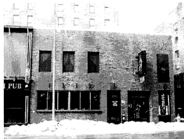
Approximate date of photo 01/27/2011