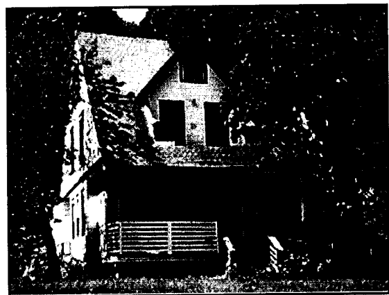
Approximate date of photo 07/10/2013