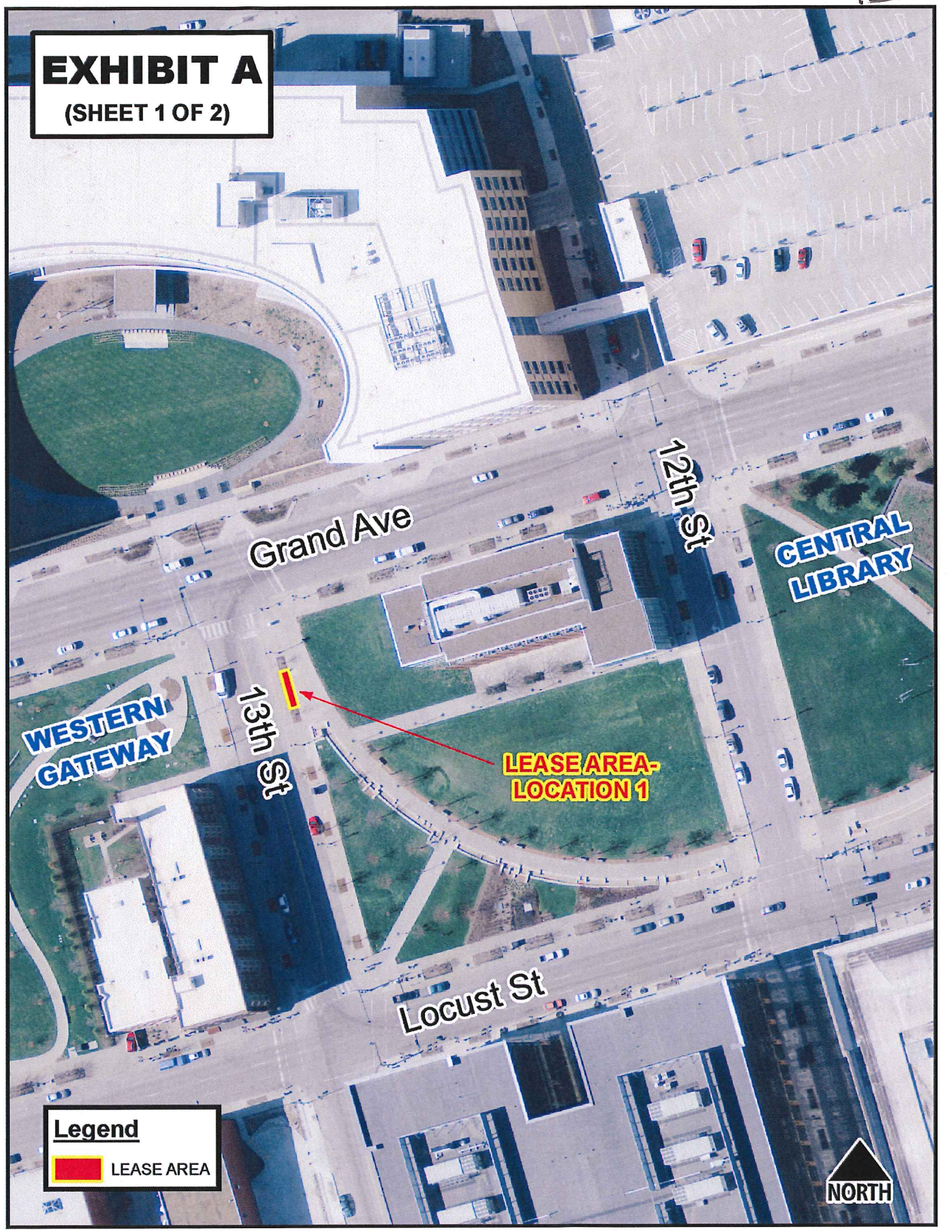
EXHIBIT A (SHEET 1 OF 2)