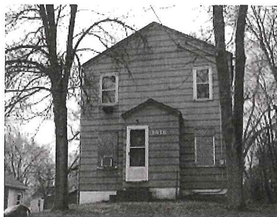
Approximate date of photo 03/21/2012