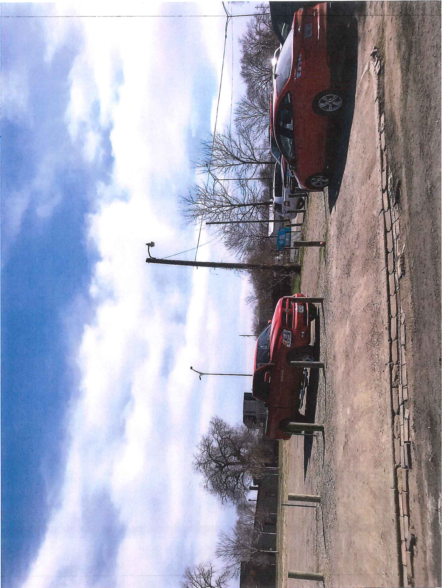
RACCOON STREET LOOKING SOUTH