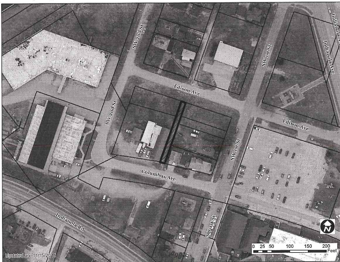
1 inch = 95 feet