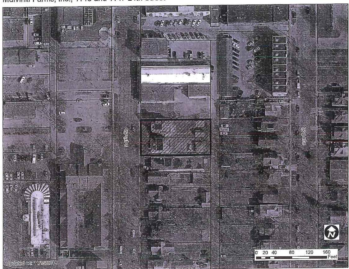
1 inch = 80 feet