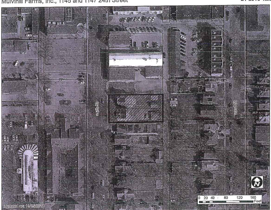
1 inch = 80 feet