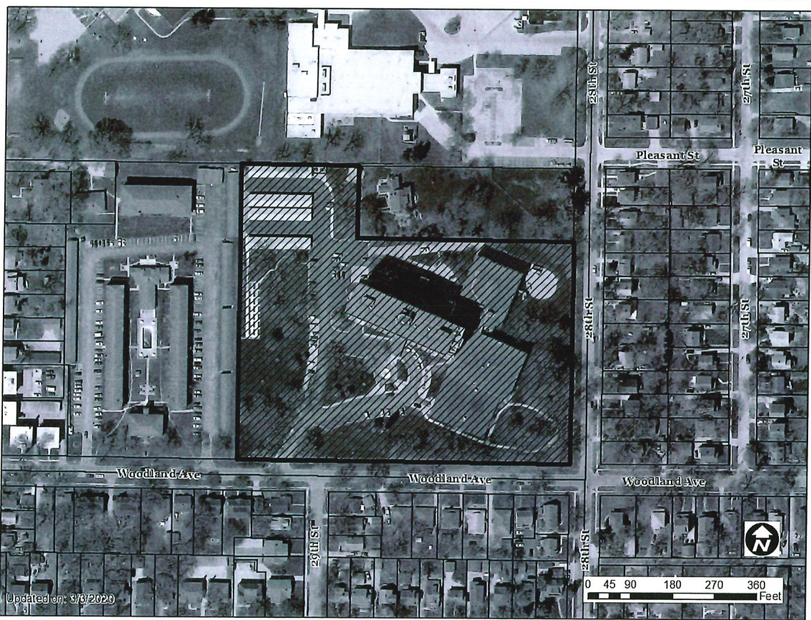
1 inch = 173 feet