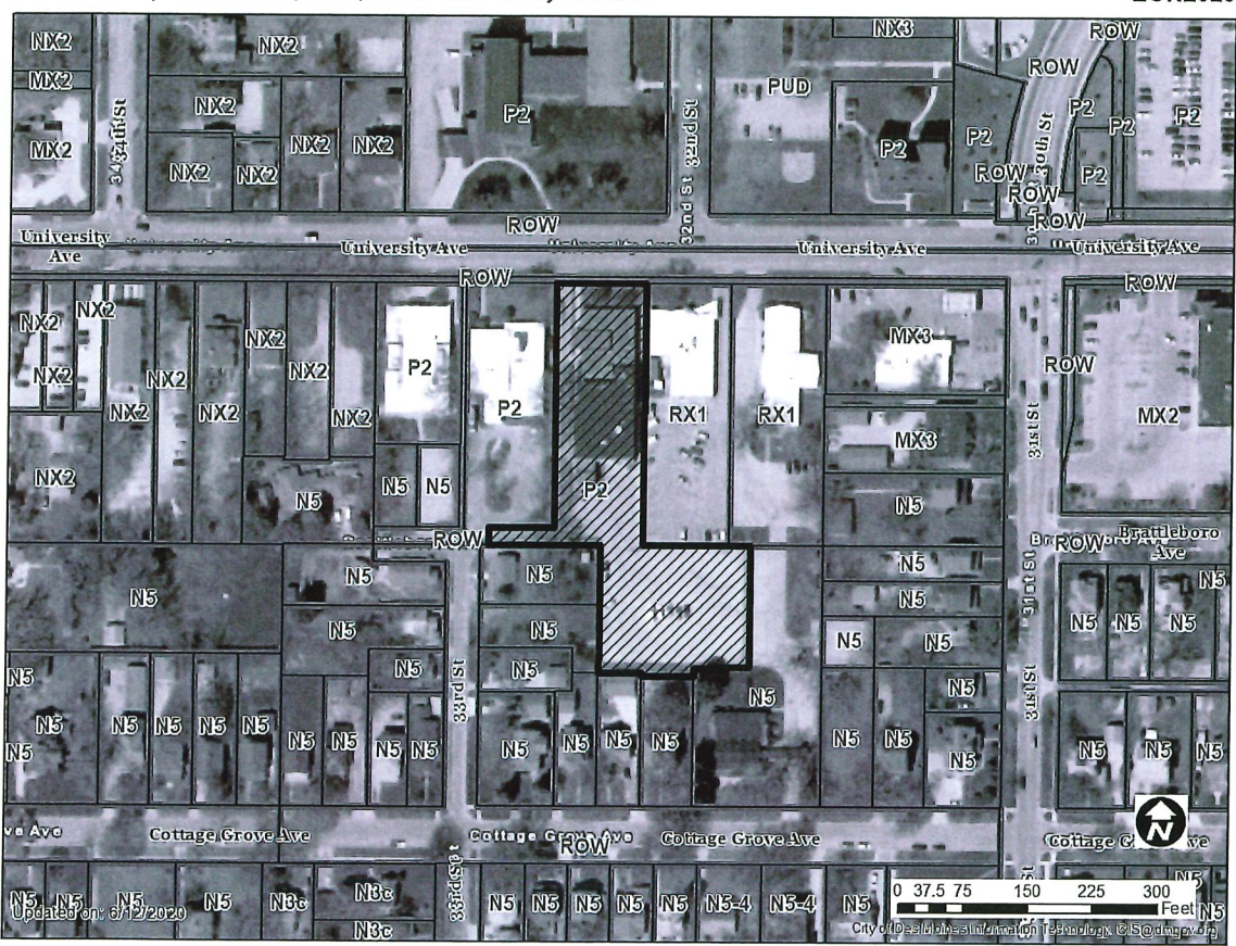
1 inch = 142 feet