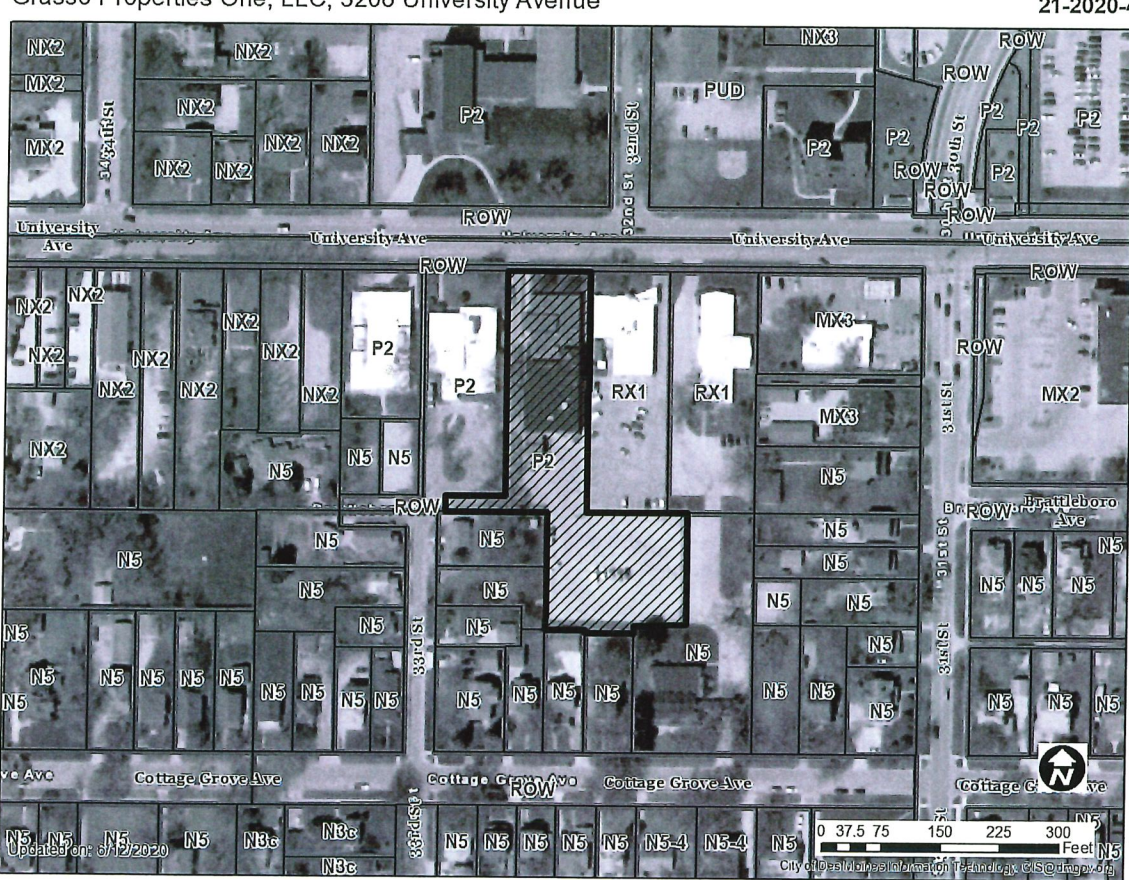
1 inch = 142 feet