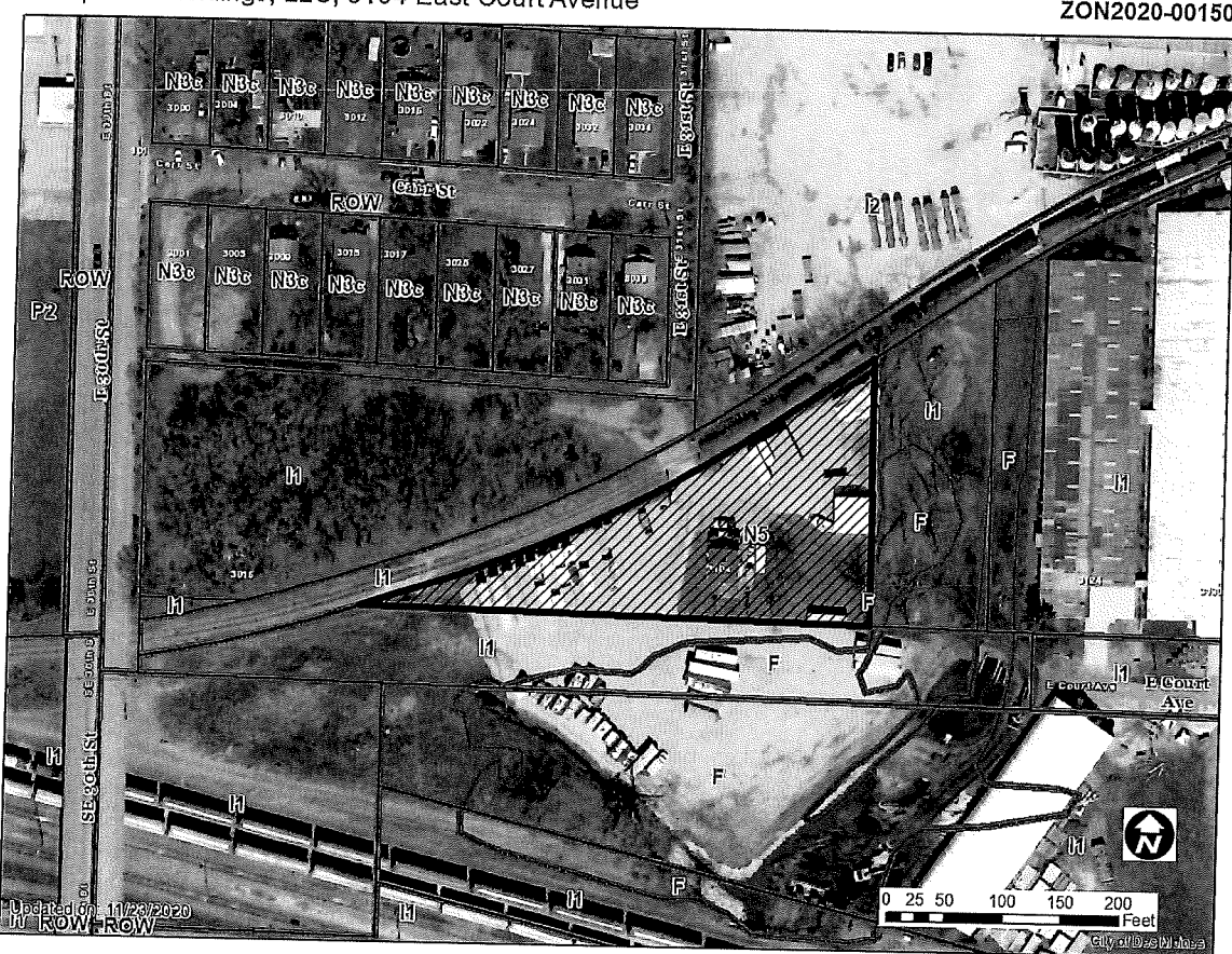
1 inch = 105 feet