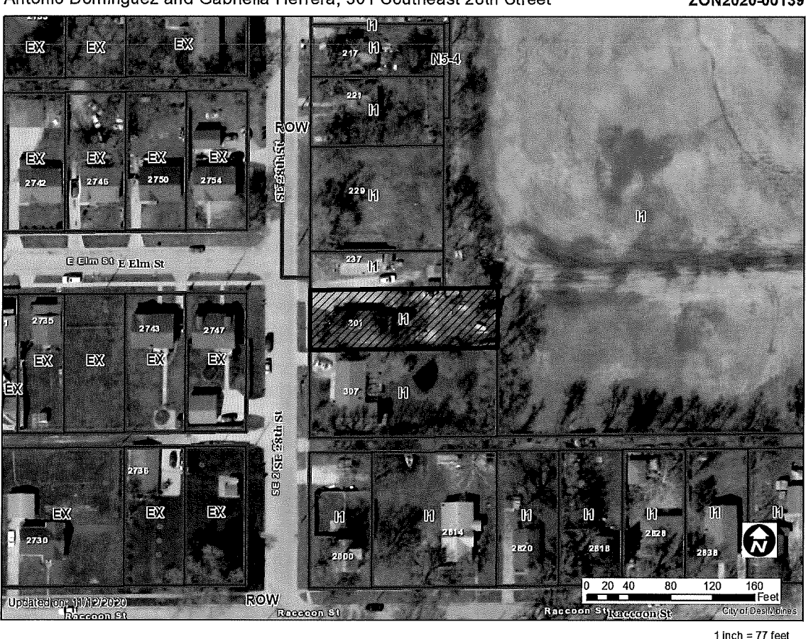
1 inch = 77 feet