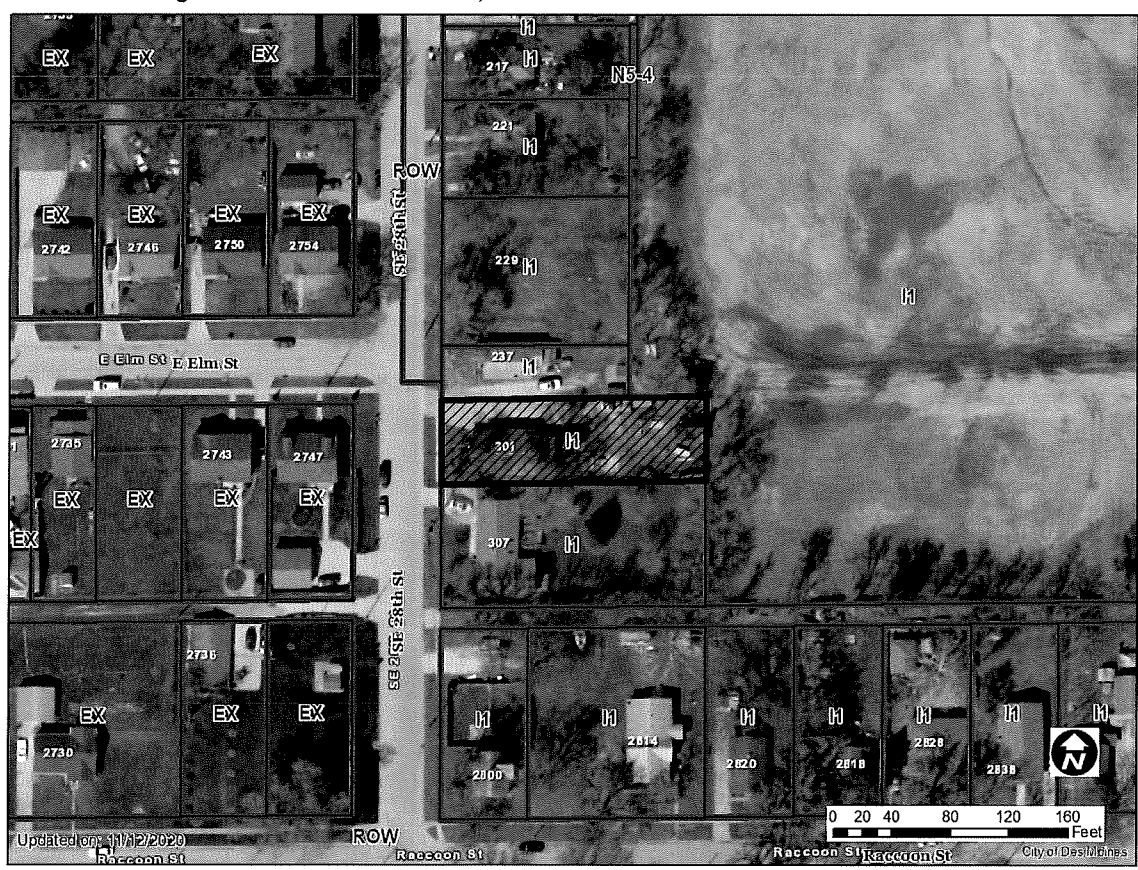
1 inch = 77 feet