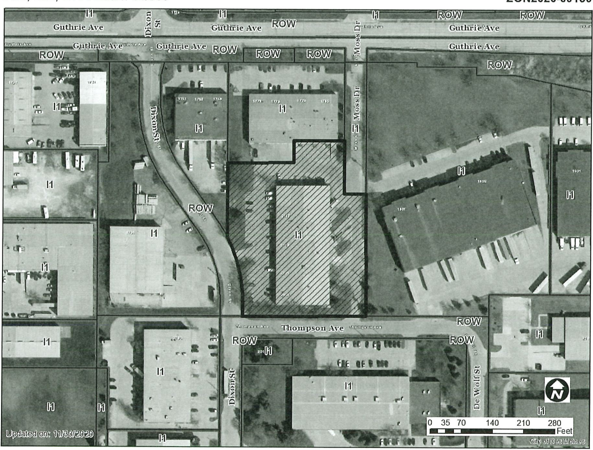
1 inch = 133 feet