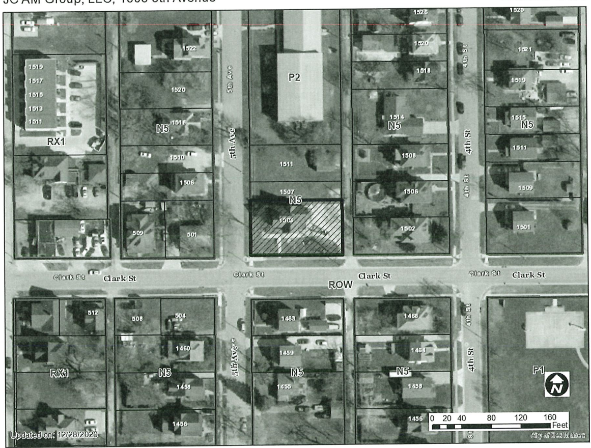
1 inch = 79 feet