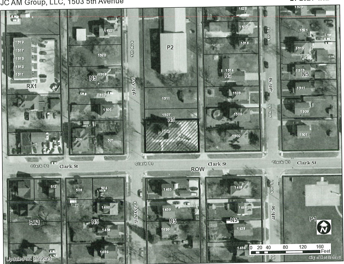
1 inch = 79 feet