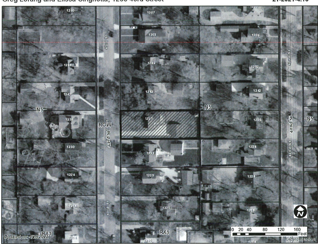
1 inch = 78 feet