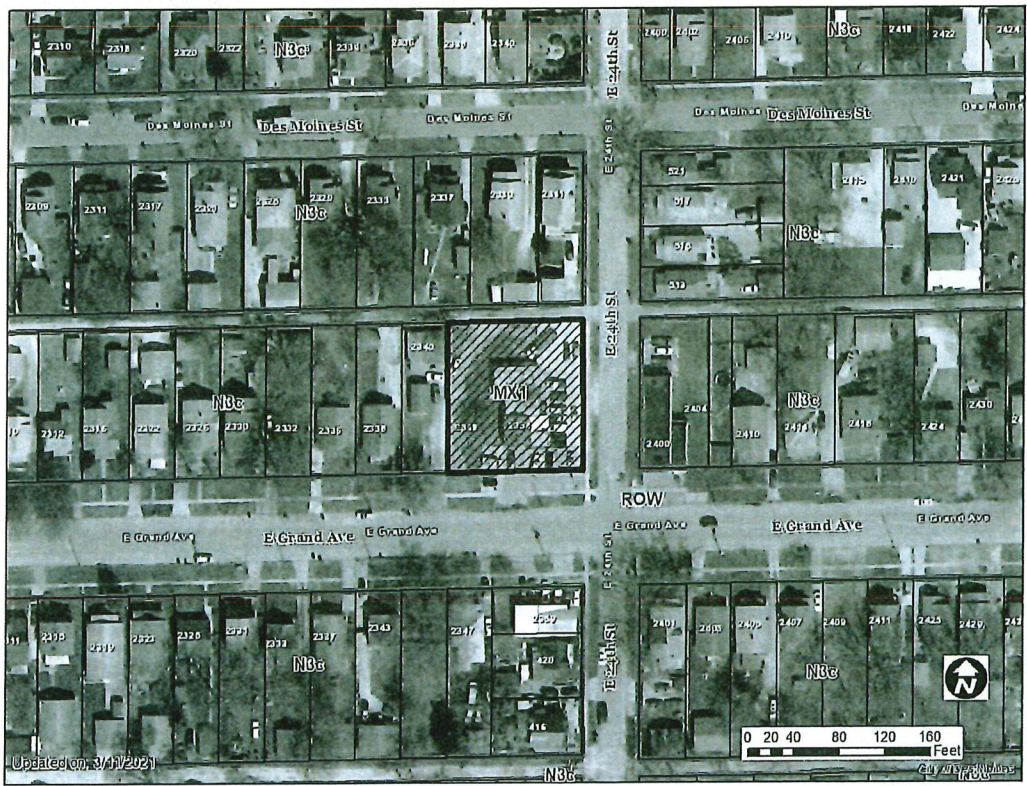
1 inch = 89 feet