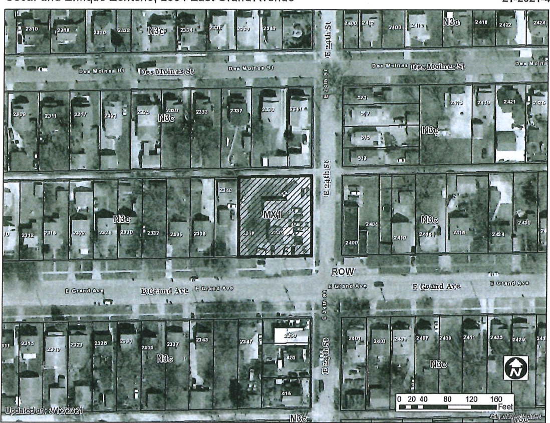
1 inch = 89 feet