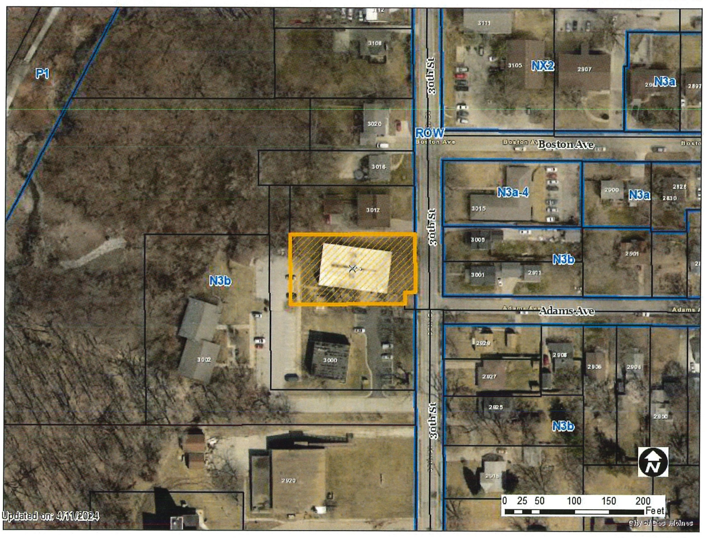
1 inch = 100 feet