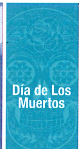
artcenter banner pair 4 RIGHT