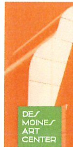
artcenter banner pair 3 LEFT