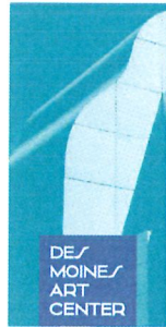
artcenter banner pair 2 LEFT