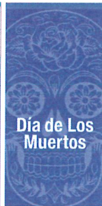
artcenter banner pair 2 RIGHT