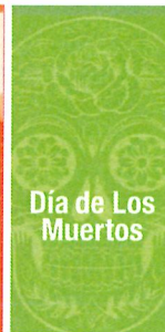
artcenter banner pair 3 RIGHT