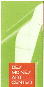
artcenter banner pair 1 LEFT