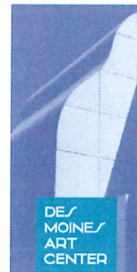
artcenter banner pair 4 LEFT